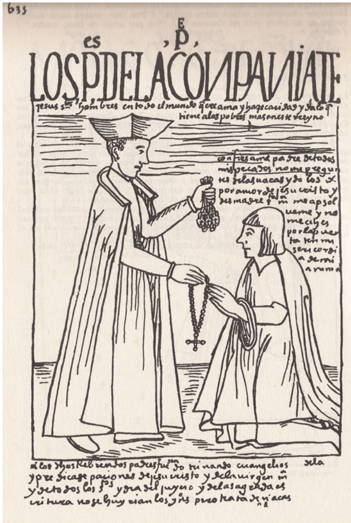
FIGURE 4 An Andean Indian Giving Confession to a Priest (from Guaman Poma de Ayala, 1980:635).